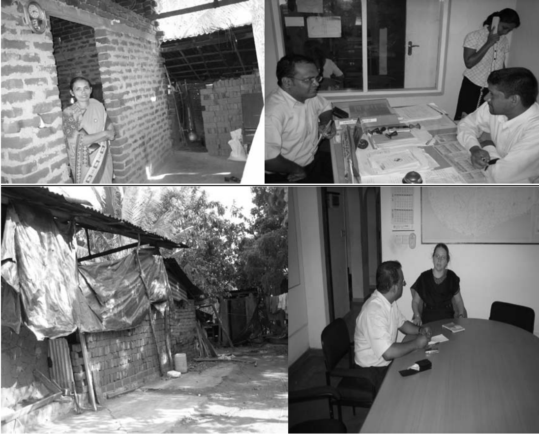
Havoc of Hambantota ;( After one year still shade of Tsunami reminding there), field visit (26-28 th July, 2006).

Hambantota is one of the largest Tsunami affected area in Sri Lanka, where most numbers of minority community (Muslims) affected and loss their life and livelihood (UNHCR). We find lot of cases of discrimination and human right violation and case of favouratism. After the one and half year after the tsunami people need assistance to rebuild their house and recovery their livelihood. Though Taiwan Government has provided 640 houses for affected communities. But most of the Singhalese people benefited out of this Project comparative to Muslim communities.